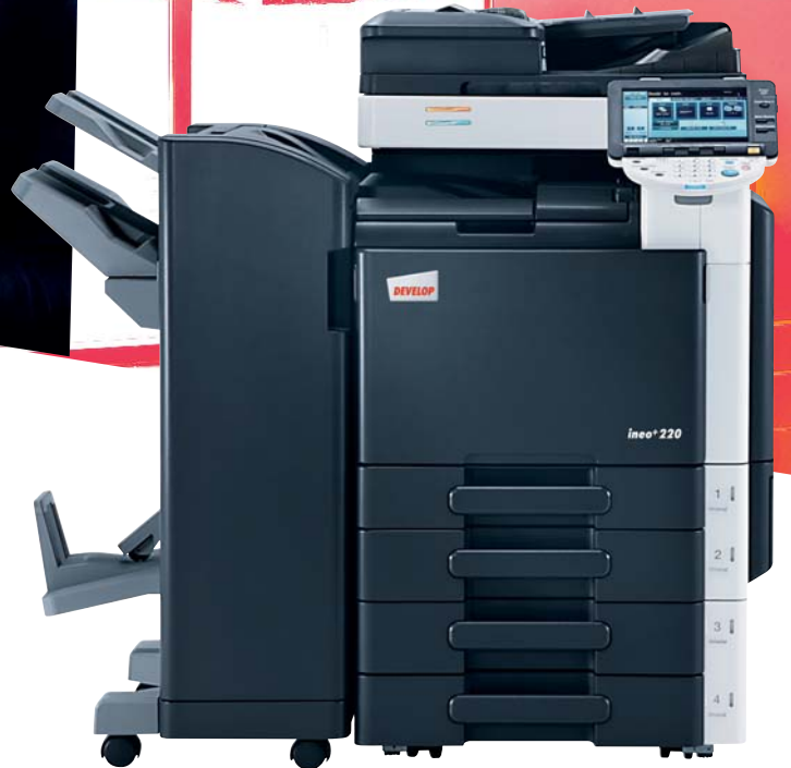
ineo+ 220 with document feeder (DF-617), floor-type finisher (FS-527), saddle kit (SD-509) and 2x 500 sheets universal tray (PC-207)