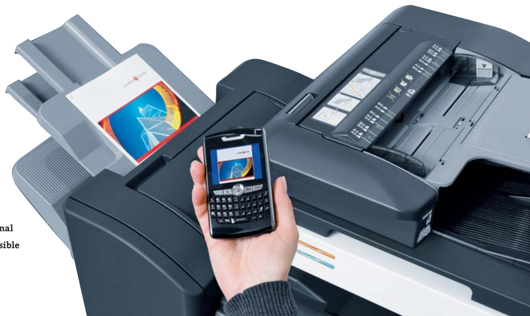
Mobile printing via optional bluetooth connection possible