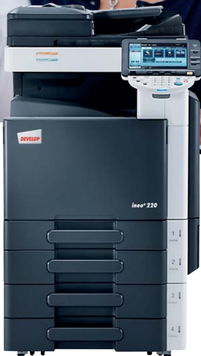
ineo+ 220 with document feeder (DF-617) and 2x 500 sheets universal tray (PC-207)