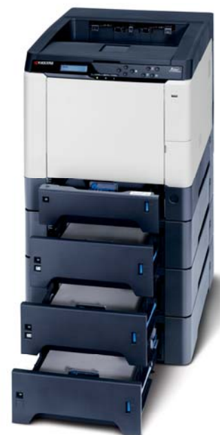
Product depicted includes optional extras.